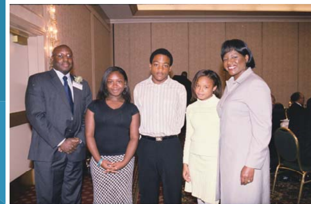
Photographs from 2007 Awards Breakfast